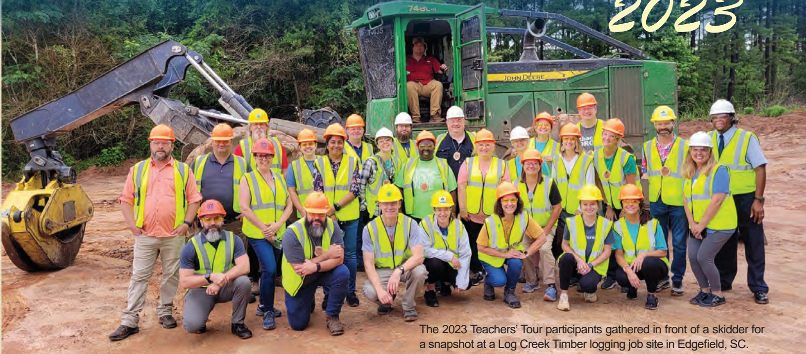
The 2023 Teachers' Tour participants gathered in front of a skidder for a snapshot at a Log Creek Timber logging job site in Edgefield, SC.