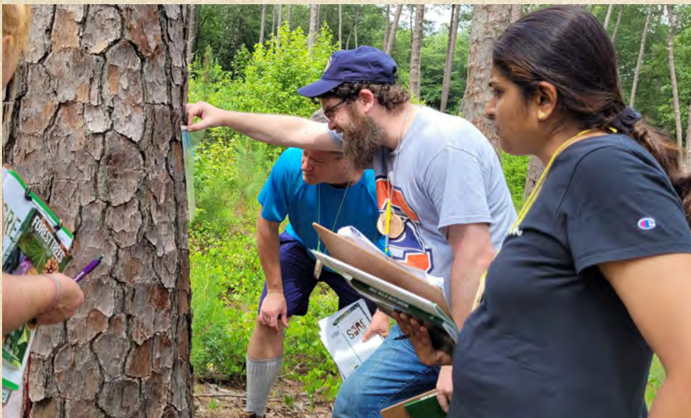
The teachers examined tree health during a Project Learning Tree exercise.