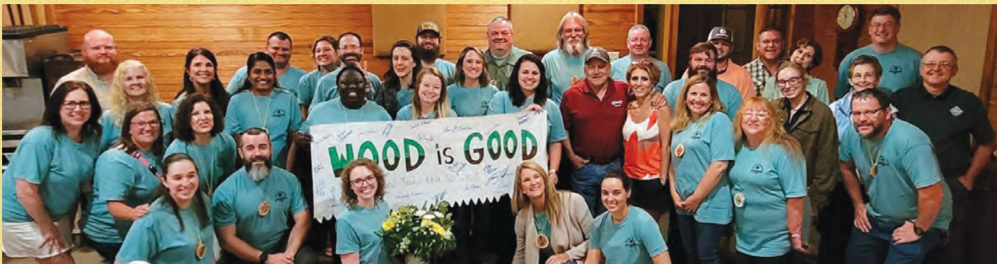
Tour participants and a few of the program speakers and sponsors posed with an autographed WOOD IS GOOD banner .